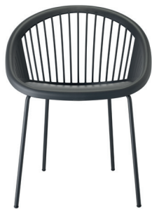
2684 VA 81