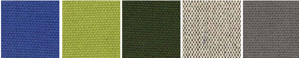
051 MEDITERRANEAN BLUE 026 PISTACHIO 028 OLIVE GREEN 012 LINEN 683 SLATE