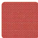
50974 Orange NEW COLOUR