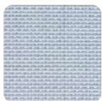
00566 Light Grey