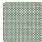
50967 Green NEW COLOUR